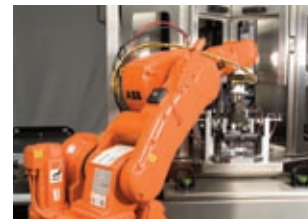
MULTI-AXIS SERVO ROBOT SHOWN INTEGRATED INTO A SUNNEN MODULAR HONING SYSTEM.