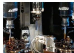
AT THE BEGINNING, MIDDLE, OR END OF THE HONING PROCESS, SUNNEN'S INTEGRATED AIR GAGING SYSTEMS ENSURE PRECISE BORE SIZE AND STRAIGHTNESS, PART AFTER PART.

Our automation and other customization options are designed to increase the operational efficiency of your precision honing system while significantly reducing labor costs. From integrated air gaging to robotic materials handling, Sunnen solutions can be customized to satisfy the requirements of even the most specialized applications.